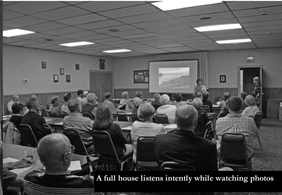
A full house listens intently while watching photos