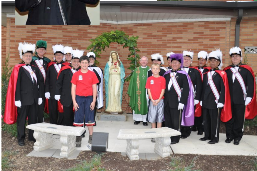
Dedication of Blessed Virgin Shrine