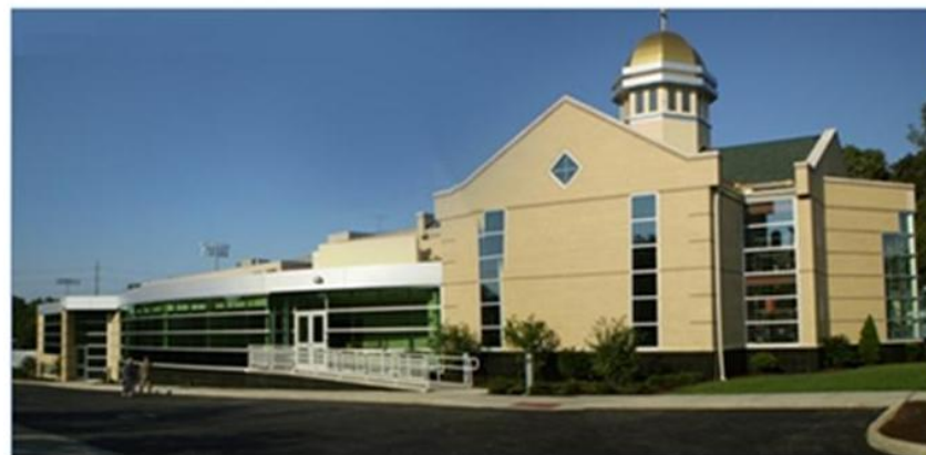
The Golden Dome of the Chapel at St Edward High School

Sir Knights in Full Regalia are Asked to assemble at 5:30 PM