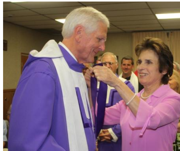
"The Proud Moment"

The worthy Outside Guard says, "You can call me Al."