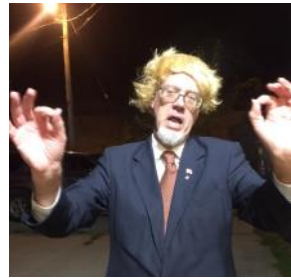
Is that a beloved PGK? Or did Donald Trump make an impromptu visit to the Turkey Raffle???