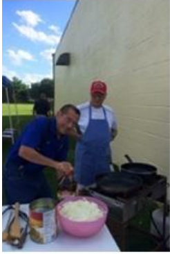
Fr. Ragan Past Grand Knights - 2015